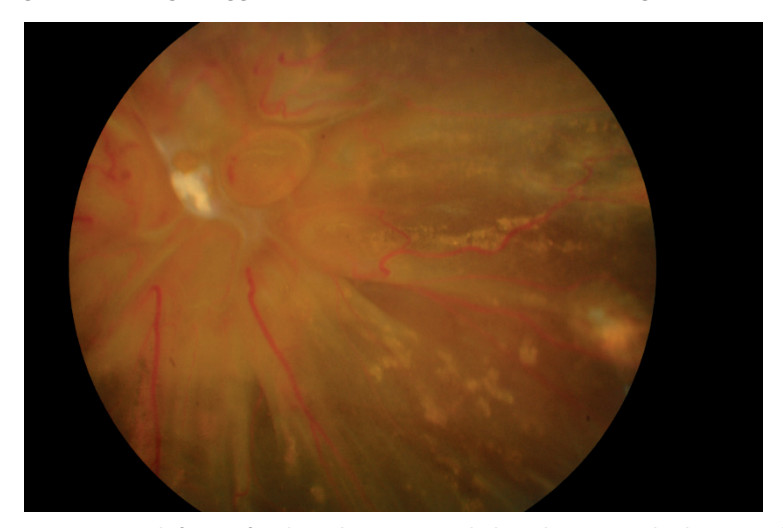
Fig. 3. Postoperative left-eye fundus photo. Retinal detachment with the retinal blood vessels appearing tortuous, dilated, and straightened due to contraction of the underlying proliferative vitreoretinopathy membrane.