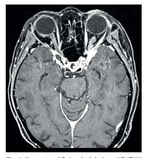
Fig. 1. "tram-track" sign (axial view; MRI T1W post-contrast).