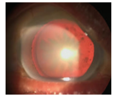
Fig. 1. Retroillumination view of double rosette cataract in the right eye.